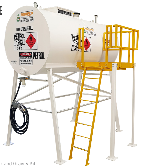
OH5000-F with Ladder and Gravity Kit