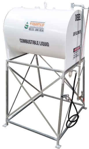
OH2000ECO-C with Bottom Fill Kit and gravity kit option