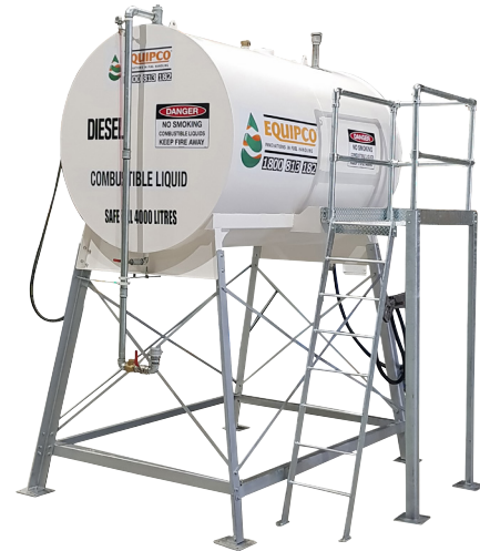
OH4000-C Overhead Tank 4000Ltr with Ladder and Bottom Fill Kit option