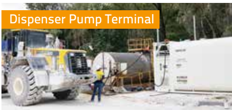
Dispenser Pump Terminal