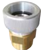
40S SWIVEL 1½" M - 1½" F.