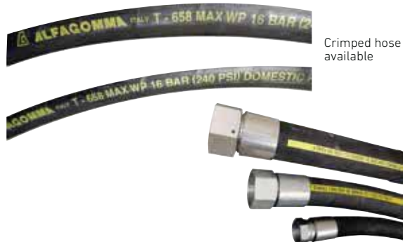
Crimped hose available