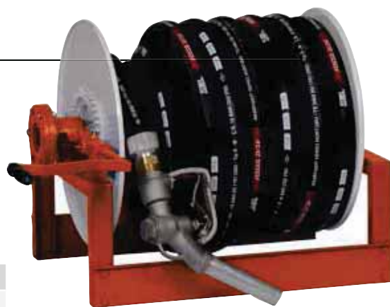
Shown with optional hose, swivel and nozzle